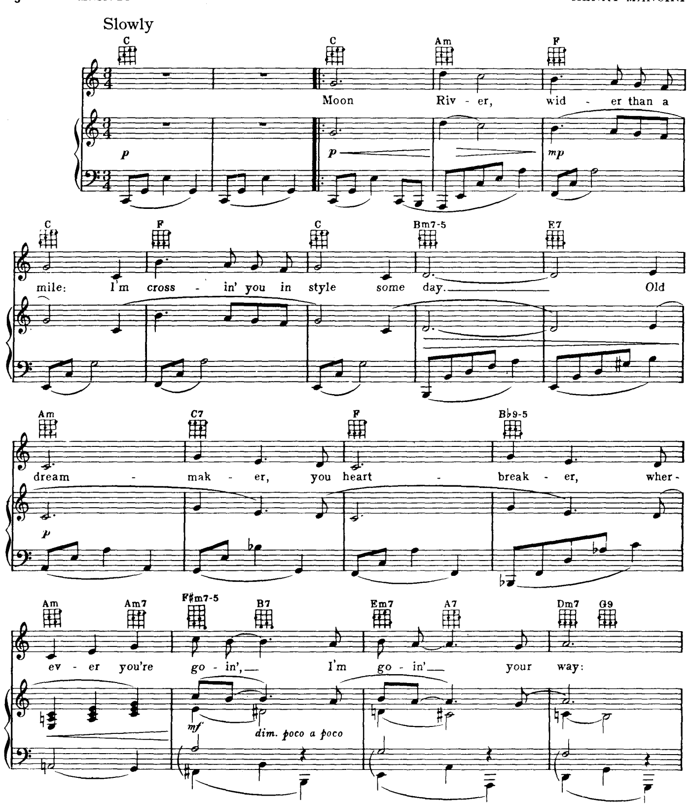
Copyright © MCMLXI by Famous Music Corporation, 1619 Broadway, New York 19, N. Y.

Compass Music Ltd., 50, New Bond Street, London, W.1.